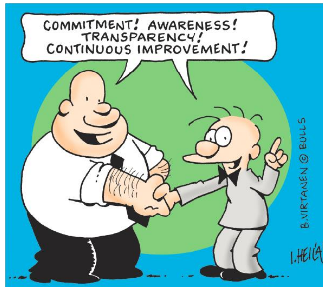
Figure 2. Cartoonist's illustration of the safety culture principles that is used in posters and screensavers since 2016

In the nuclear industry, graded approach is applied to define the requirements of a product, system, structure or process commensurate with its relative importance, e.g., with regards to safety or quality [17]. Fennovoima applies graded approach in supply chain safety culture assurance to grade the safety culture assurance activities related to a given supplier on a four-level scale (A-D). The resulting safety culture assurance grades are not intended to serve as indicators of the safety significance of the supplier, but to define the extent of use of the safety culture assurance methods described in this document.