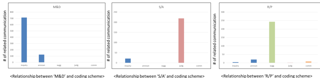
Figure 3: Relationship between cognitive steps and speech act coding scheme

As shown in Fig. 3, there was significant relationship between the cognitive step and speech act coding scheme. It shows that which speech act coding scheme was mostly used by operators when they perform cognitive activities. In addition, by observing the speech act coding scheme, what cognitive activities were performed could be figured out.